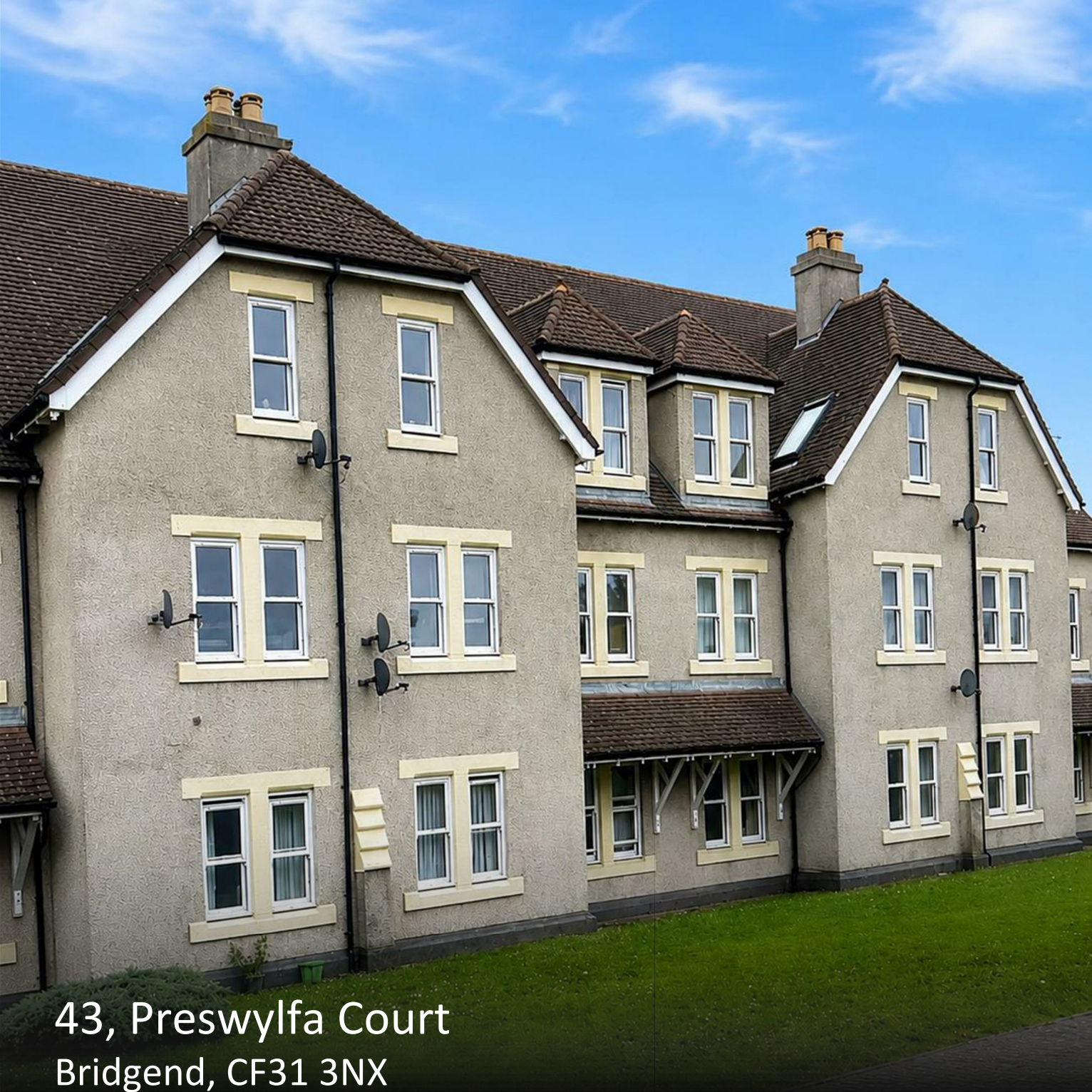
43, Preswylfa Court Bridgend, CF31 3NX